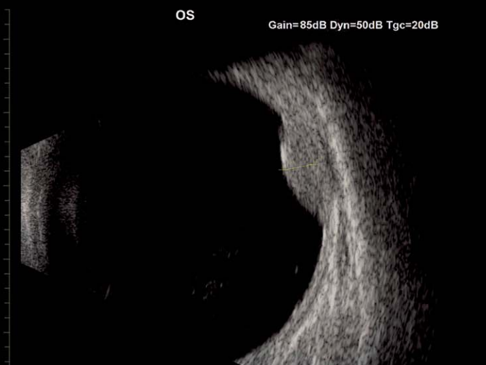
Choroidal melanoma