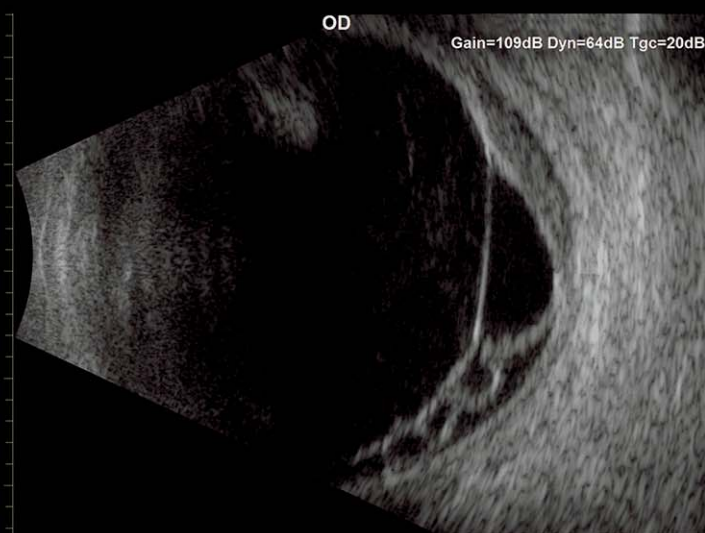
© Adil El Maftouhi - Hôpital des XV-XX (Paris, France) Centre Ophtalmologique Rabelais (Lyon, France) Diabetic Retinal Detachment

The Compact Touch has the exclusive technology of biometry in B-mode that allows to automatically measure the axial length from a B-mode image.